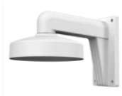
HIA-B401-110T Wall Mounting Bracket