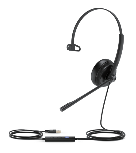
<u>UH34Mono</u>/UH34 Lite Mono Teams UH34/UH34 Lite

The hand-held controller with LED indicator provides easier access to key call control capabilities, including answer call, end call, reject call, and mute/unmute.