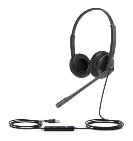
<u>UH34 Dual</u> /UH34 Lite Dual Teams UH34/UH34 Lite