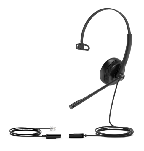
YHS34_Mono/YHS34 Lite Mono

Built for comfort with soft ear cushions and ultra-lightweight materials, the YHS34/YHS34 Lite is 10%~30% lighter than other headsets in the same range. Its ergonomic design makes this headset comfortable enough for long conference calls and all day use.