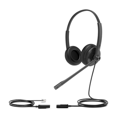
YHS34/YHS34 Lite Dual