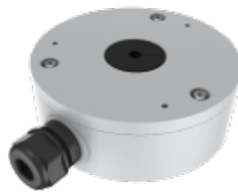
TC-P54BM SPEC: V5 JUNCTION BOX