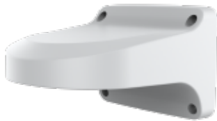
A29 A29 WALL MOUNT